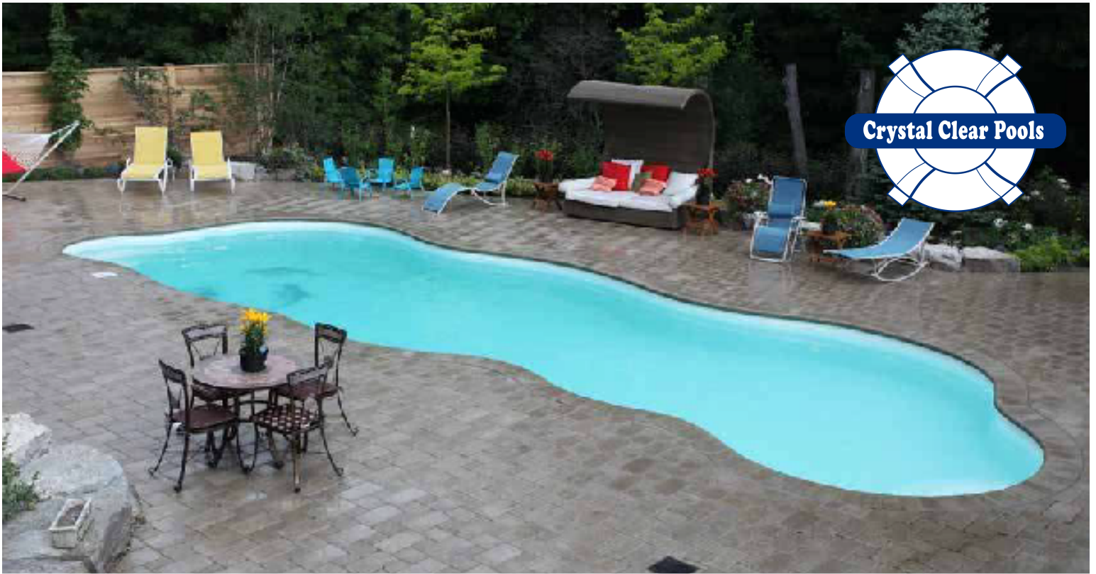
Taj - Mahal