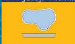
Tanning Ledge - Freeform

Width: ..... 11'11" / 3.63 M Length: ..... 17'2" / 5.23 M Depth: ..... 1'6" / 0.46 M Area: ..... 119 ft 2 / 11 M 2 Volume: ..... 724 G / 2,740 L