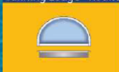
Tanning Ledge - Round

Width: ..... 11'7" / 3.6 M Length: ..... 7'7" / 2.35 M Depth: ..... 1' / 0.16 M Area: ..... 65 ft 2 / 7 M 2 Volume: ..... 150 G / 567 L