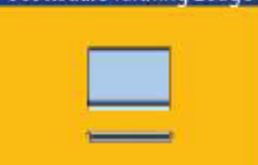
Scottsdale Tanning Ledge

Width: ..... 8'3" / 2.5 M Length: ..... 12' / 3.64 M Depth: ..... 12" / 0.16 M Area: ..... 80 ft 2 / 8 M 2 Volume: ..... 100 G / 378 L